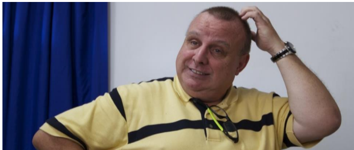
Trying to find my brain for the transplant